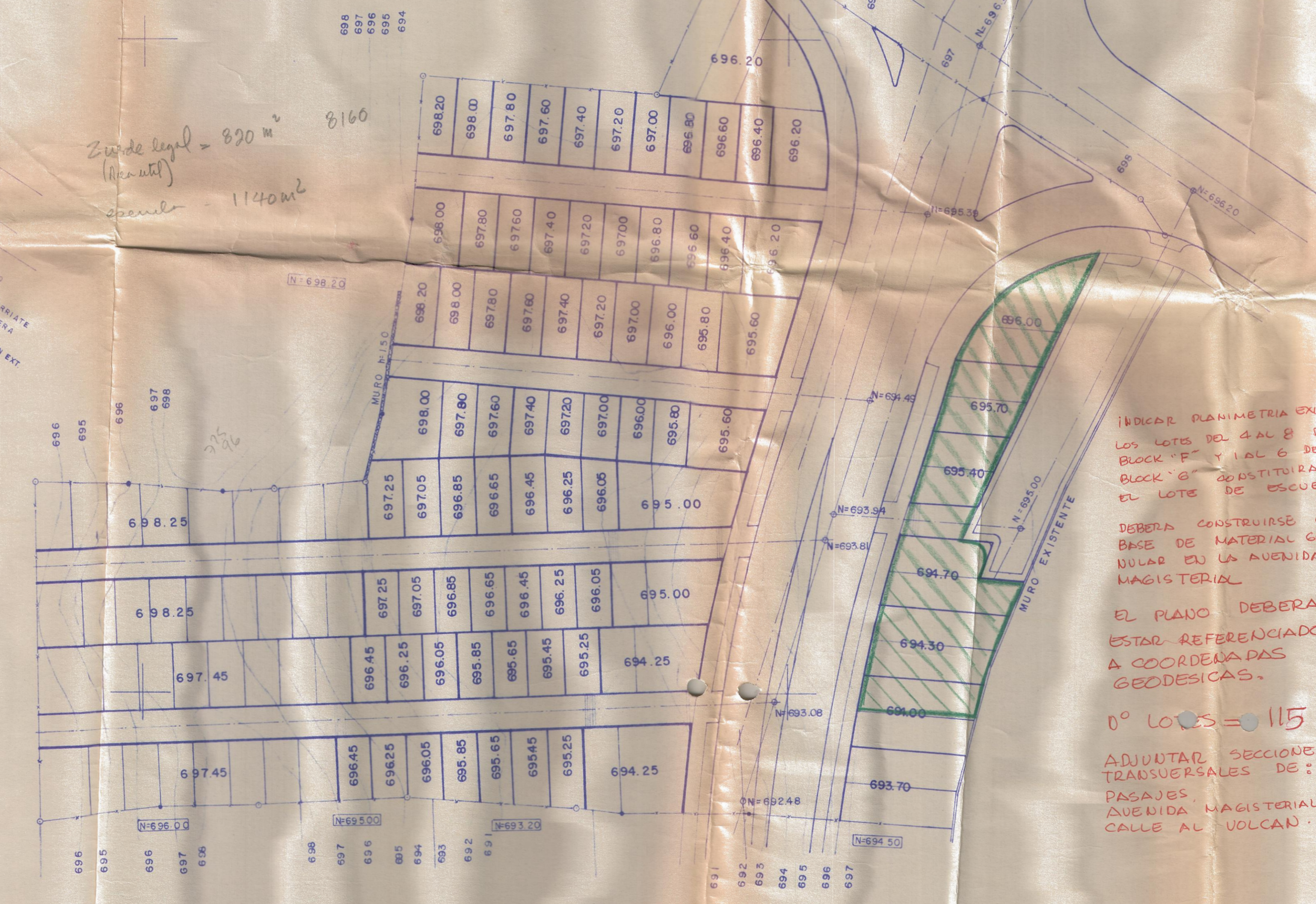
DISTRIBUCION DE LOTES - PLANTA DE TECHOS esc. 1:500